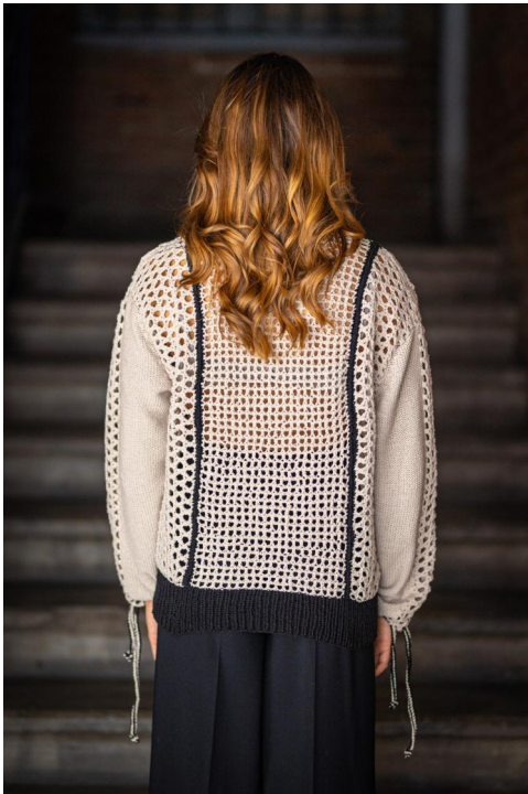
Schema 1: Punto rete filet