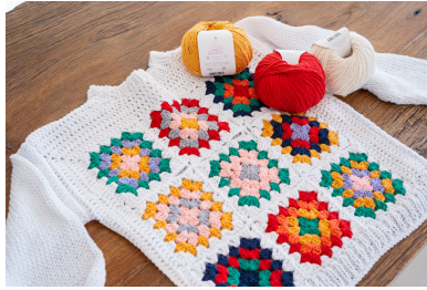
Schema 2: unione dei motivi, bordo e spalla